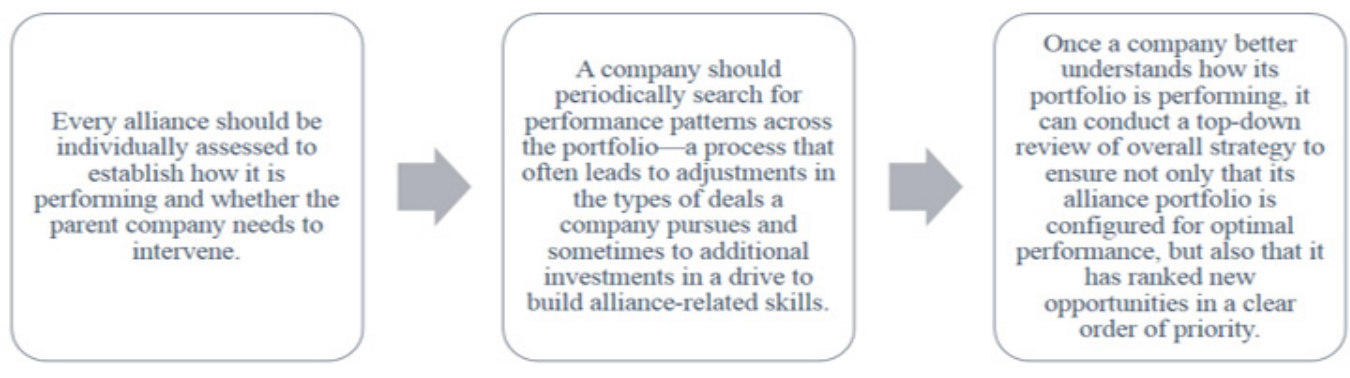
Figure 3. Alliance performance assessment.

Revista științifica a Universtității de Stat din Moldova, 2023, nr. 11(01)